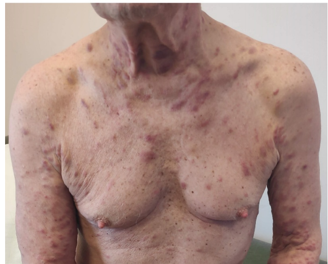
Figure 1. multiple skin lesions in primary cutaneous myeloma

Brentuximab vedotin was initiated in August 2019, but after three cycles, anemia and thrombocytopenia recurred. In October 2019, treatment was switched to lenalidomide with weekly dexamethasone. By January 2020, rash, fatigue, and pancytopenia reappeared, although PET/CT showed only a single small FDG-avid pulmonary lesion.